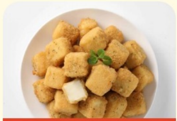
Crispy Tofu Bites (35 oz)