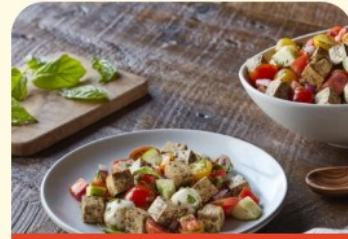
Organic Plain Toss'ables (2.5 lb)