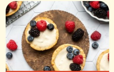
All Natural Silken Tofu (16 oz)