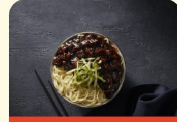
Black Bean Sauce (3 lb)