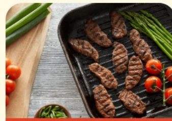
Plantspired Steak - Korean BBQ (35 oz)

Our products are available through Dot Foods!