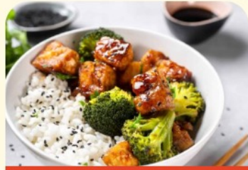
Organic Super Firm Tofu (6 lb)