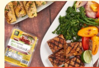
Savory Baked Tofu