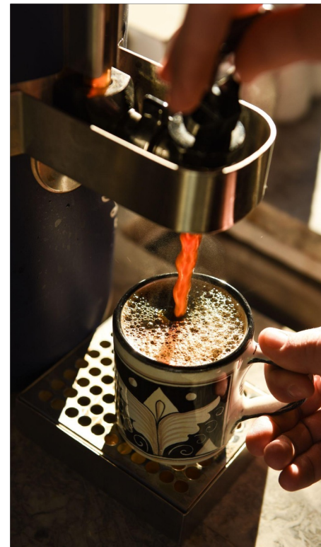
DRIP COFFEE SET-UP