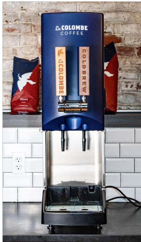
ON-TAP COLD BREW + LATTES