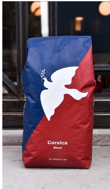
BULK ROASTED COFFEE