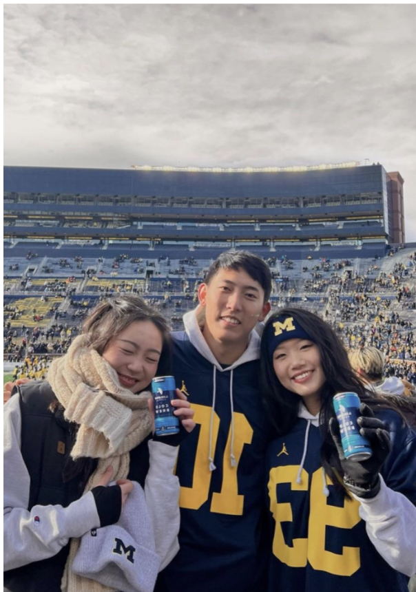
UNIVERSITY OF MICHIGAN